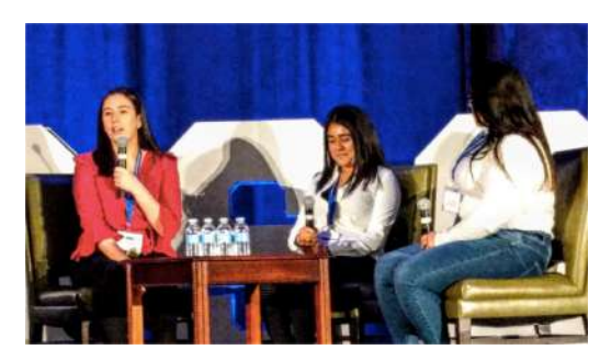
Members of SHABABY share their work as youth advocates in the San Diego-area South Bay community.