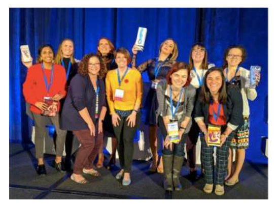
Team "Clit-orate" - Trivia Game Winners at the SSS Student Luncheon with their Prizes!