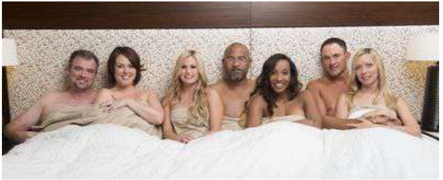
Adapted from the Kinsey Institute Memorial