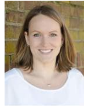
Member at Large:

"I have participated in SSSS since 2010, after which I immediately got involved volunteering for the organization. I love the interdisciplinary nature of this society, as well as the innovative space the meetings and society provide members."