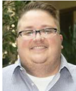
Member at Large:

"As a member of SSSS for over a decade, I have valued the opportunities to connect with and learn from sexual science colleagues from around the world. This additional term will allow me to implement my vision for a financially healthier SSSS."