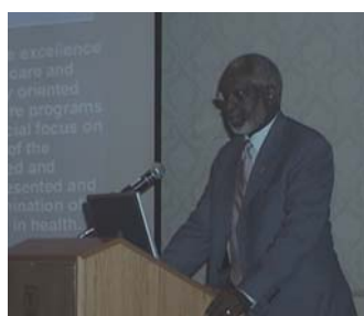
Former U.S. Surgeon General, David Satcher, MD, PhD, gives his plenary address.